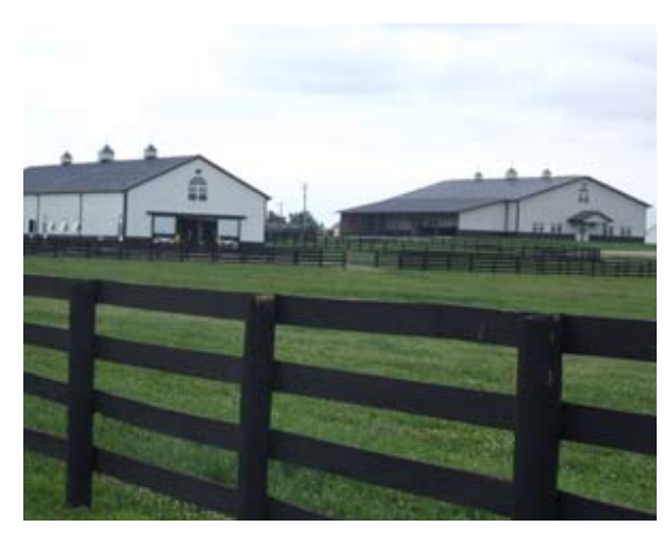
All proceeds from auctioned horses goes toward farm operation expenses.

While Maine Chance has historically been home to Thoroughbreds, the current program also includes Quarter Horses. Its two active