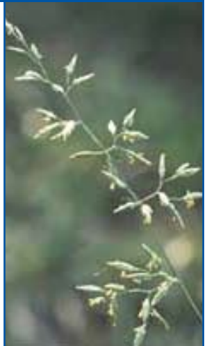
The stems and seedheads of tall fescue often contain high levels of the toxin ergovaline.

25% tall fescue, and since the stems and seedheads of tall fescue contain the highest levels of the toxin ergovaline, there is a good chance that mature hay contains toxic levels. In other areas of Kentucky and in surrounding states,