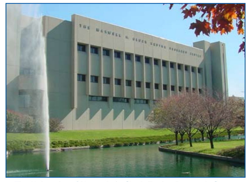
The University of Kentucky's Gluck Equine Research Center