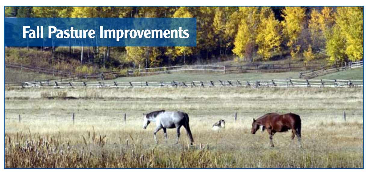
Herbaceous weeds in pastures are most easily controlled with herbicides during the fall.

all is a good time to evaluate horse pasture quality and weed control. The weeds that were most prevalent and uncontrolled during the summer will now be large and producing seeds.