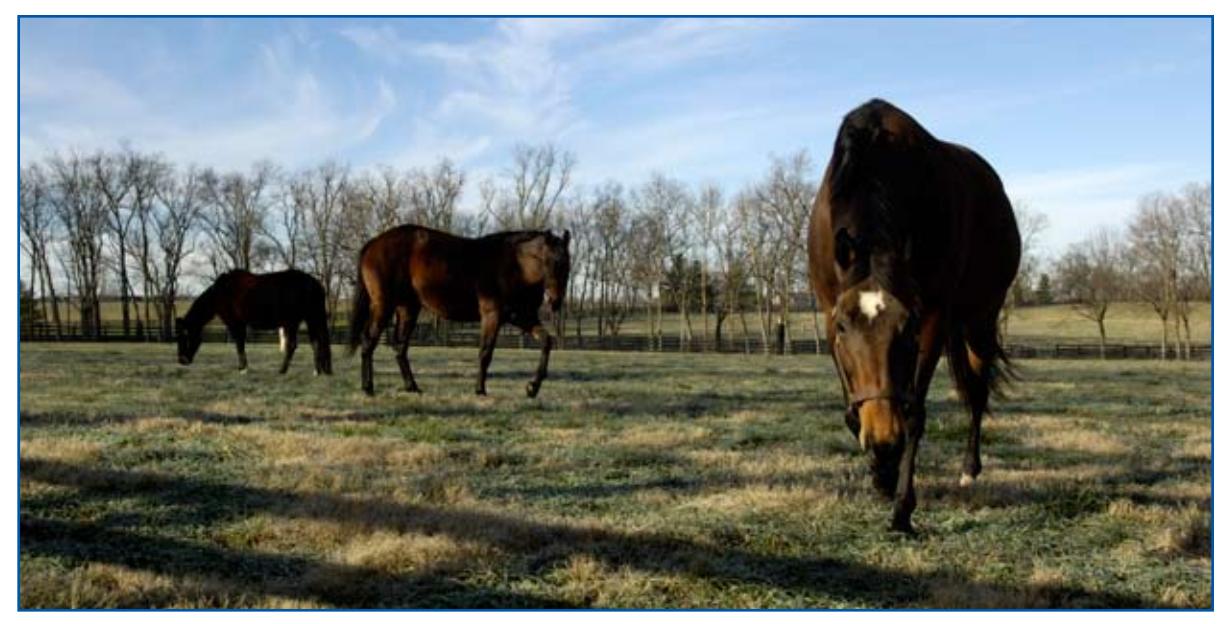
Many breeders want their mares to begin winter with a BCS of 6, or moderately fleshy.

Evaluate body condition by palpating the amount of fat in several areas on the horse: The neck, shoulder, ribs, withers, behind the shoulder, and above the back and tailhead. A horse in moderate body condition will have enough fat cover that the ribs are easily felt but not visible. There should be enough fat cover on the withers, back, tailhead, pelvis, and shoulder so the body parts blend to together smoothly. Remember to evaluate the amount of fat cover manually, as a