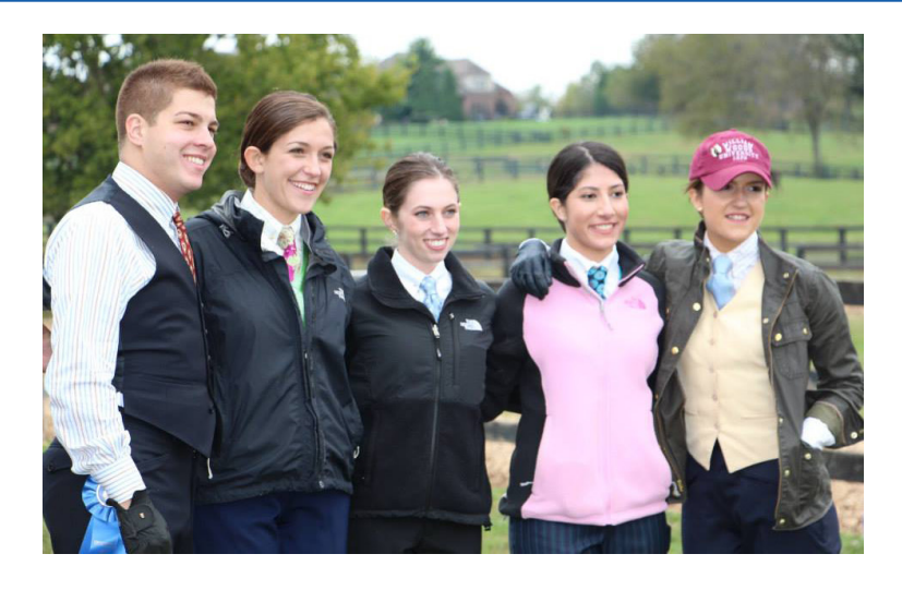
Left: A member of the UK Rodeo Team competes in barrels. Above: Members of the Saddle Seat Team at a recent show in Kentucky.