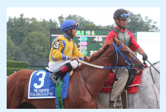
Casiguapo racing at Saratoga

prestige. Having a horse bred by the university in such a key race is a huge boost for how others view our program. This can translate to better results at the sales and more exposure for the equine program and Maine Chance Farm.