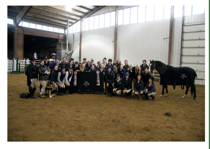
Hunt Seat Team after a recent competition.

On Jan. 31 and Feb. 1, the team hosted its home horse show at Lakeside Arena. The show was a great success and all events ran smoothly and safely. The hunt seat team won high point team both days. Thank you to everyone for their hard work and dedication over the weekend. Hosting a show is tough work, but all team members deserve a pat on the back for their enthusiasm and perseverance over the weekend. Great job!