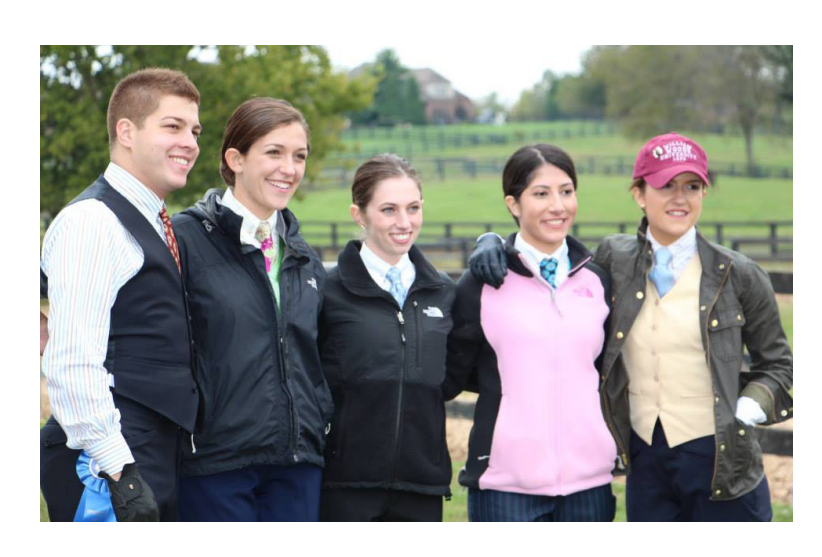
Members of the Saddle Seat Team at a recent show in Kentucky.