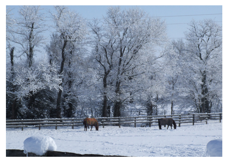
Enjoying the Bluegrass snow.

To read the entire story, visit http://uknow.uky.edu/content/happy-150th-university-kentucky.