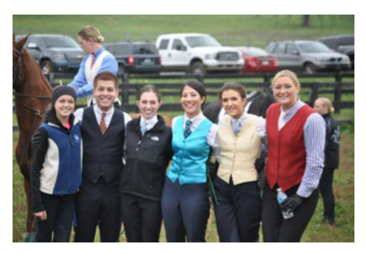
Members of the Saddle Seat Team take a quick timeout to smile for the camera.

many young volunteers who ride at her barn contribute their time and effort.