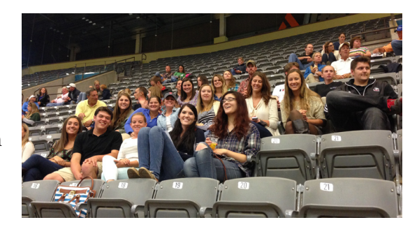
The Hunt Seat Team at the Hagyards rand Prix

Thank you to everyone who came out to the Horse Park for the Hagyards Grand Prix. It was a great night.