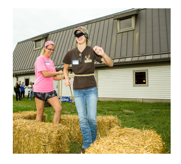
Students navigating the Blind Horse Course