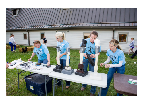
The Equine Programs' office completing the hippology quiz