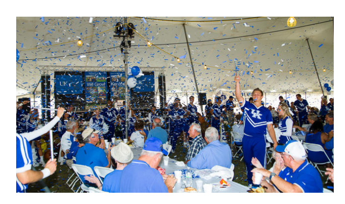
UK's Cheerleaders at the 2014 Ag Roundup