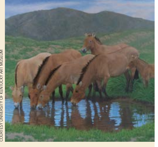
Susan Fox's Enchanted Evening, 1953

This exhibition includes 70 paintings, sculptures, watercolors, and drawings from all over the United States and tells a story about the animal kingdom. Visitors will have the chance to see a bronze sculpture of a weary lioness, a pastel of a blue jay, and an oil painting portraying a wet kiss between two otters, to name a