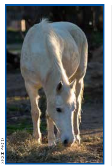
Healthy aged horses are able to digest various nutrients similarly to horses in their prime.

S ure, age is just a number, but human doctors know that's not necessarily the case when it comes to nutrition and nutrient digestibility. So do aged horses follow this same pattern? Does aging correlate with a reduced ability to digest vital nutrients even in healthy horses? That's what an international research team recently sought to find out.