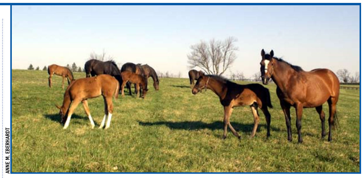
The UK Equine Showcase addressed infectious diseases, deworming, and vaccination of young horses.

In most cases, foals that don't receive adequate colostral antibodies from the mare are uniquely