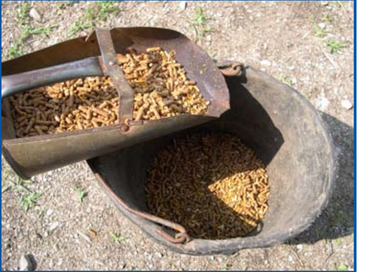
lonophore antibiotics can contaminate horse feeds.

in nontarget species (i.e., species for which ionophore use is not approved). However, poisoning can also occur in the intended species if an animal ingests excessive amounts. Most often this occurs when excessive amounts of ionophores are accidentally added to feeds, or when animals have accidental access to concentrated pre-mix formulations.