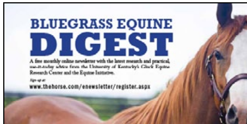
Wildcat Canter • 6

Check out the October issue of the Bluegrass Equine Digest at www2.ca.uky.edu/equine/bed