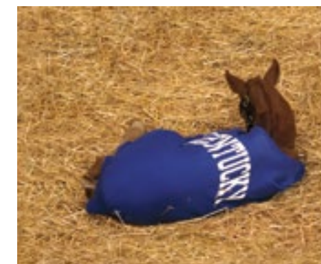
Wildcat Canter • 7