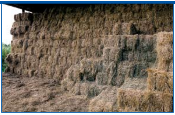
Inventory hay supplies now to ensure you have enough to last through winter.

When calculating whether additional hay is