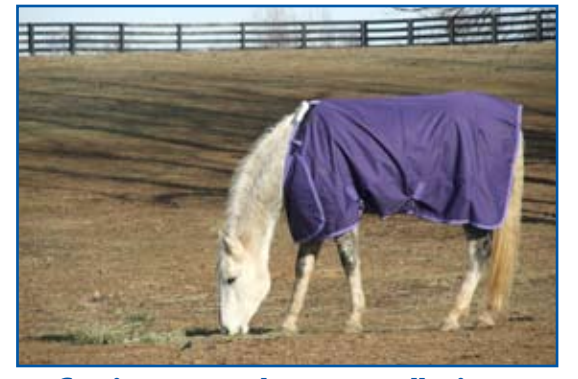
Grazing stressed pastures all winter hinders plant rejuvenation in spring.

Early fall is normally the ideal time to seed a horse pasture; however, the current drought has likely caused many fall pasture seedings this year to fail. Therefore, spring seeding of desirable grasses is recommended for thin pastures. Remember that the longer horses are kept off a seeded pasture, the better the chances of a successful establishment. Seeding should begin when daytime temperatures