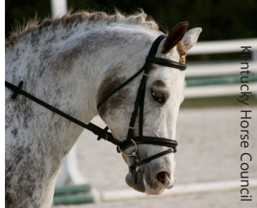
Kentucky Horse Council