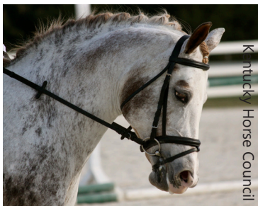
Kentucky Horse Council

For the purposes of this study, an "equine operation" is defined as an address on which at least one horse, pony, donkey or mule resides. From this study, it was determined that an equine operation encompasses the large breeding farms, property on which equines are kept for personal use and other land with a primary use that may not be equine-related, such as a cattle operation or crop farm. It is estimated that there are a total of 31,000 equine operations throughout Kentucky. These equine operations accounted for a total of 4.3 million acres of land, of which 900,000 acres were devoted to equine-related activities.