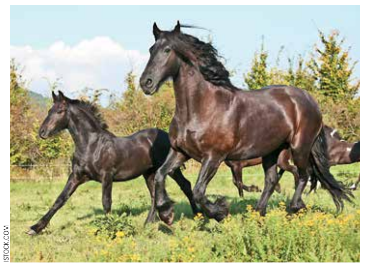
Testing for the dwarfism and hydrocephaly mutations before breeding can help ensure a healthy foal results.

Hydrocephaly is a developmental defect in foals characterized by an accumulation of cerebrospinal fluid in the brain's ventricular system. Affected foals are born with grossly enlarged foreheads and are often stillborn or require euthanasia soon after birth. A hydrocephalic foal also presents a potential dystocia (difficult