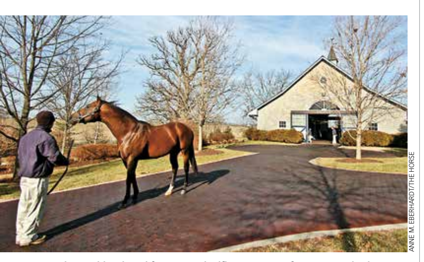
Thoroughbred stud fees are a significant source of revenue and sales tax revenue in Woodford County.

executive director. "But in these counties like Woodford County, agriculture and the equine industry are equally as important to their local economy. We drive by and see these pretty farms and think, this is a beautiful place to live, but they are also significant contributors to the local economy."