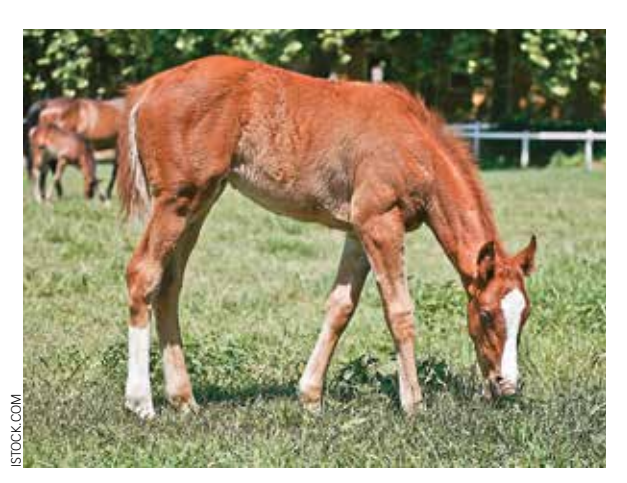
Foals rarely develop larval cyathostominosis because they don't have a large enough population of encysted third-stage larvae, researchers learned.

Researchers have rigorously studied small strongyles, or cyathostomins, and their impact on horses over the years. After all, these ubiquitous parasites affect virtually every grazing horse throughout the world. Scientists focused the bulk of that research, however, on adult horses rather than foals, and a recently published