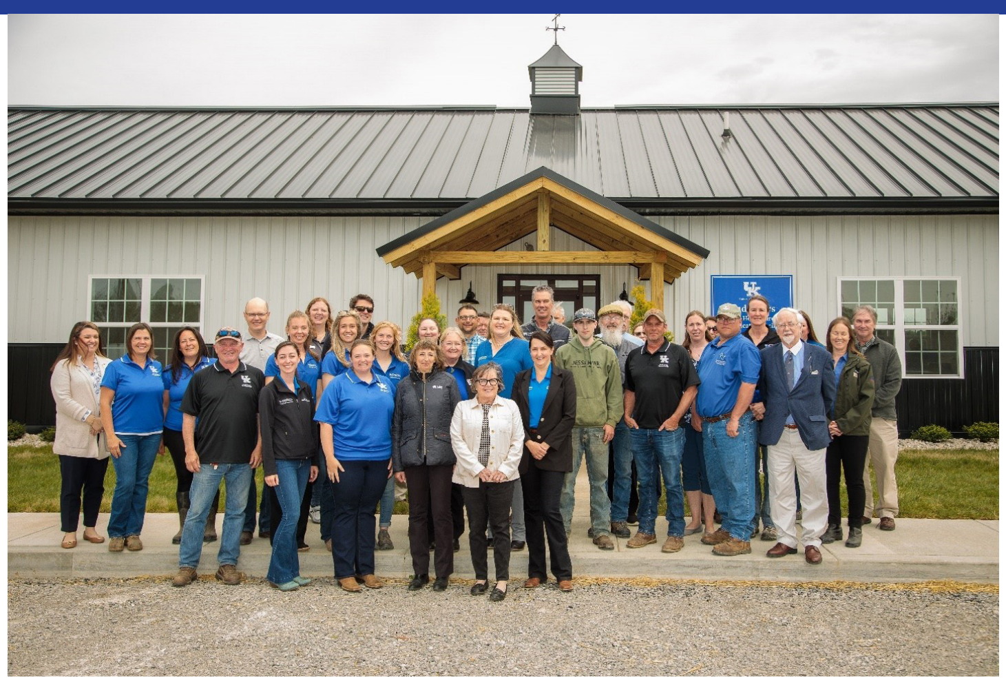
THE LINDA MARS AGED HORSE CARE AND EDUCATION FACILITY WILL HELP LEAD BREAKTHROUGHS IN CARE FOR OLDER HORSES.

University of Kentucky's Aged Horse Care and Education Facility marks official opening, launching new possibilities for research and training