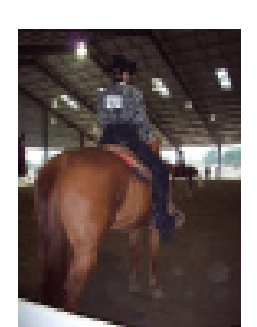
Gaskin riding at