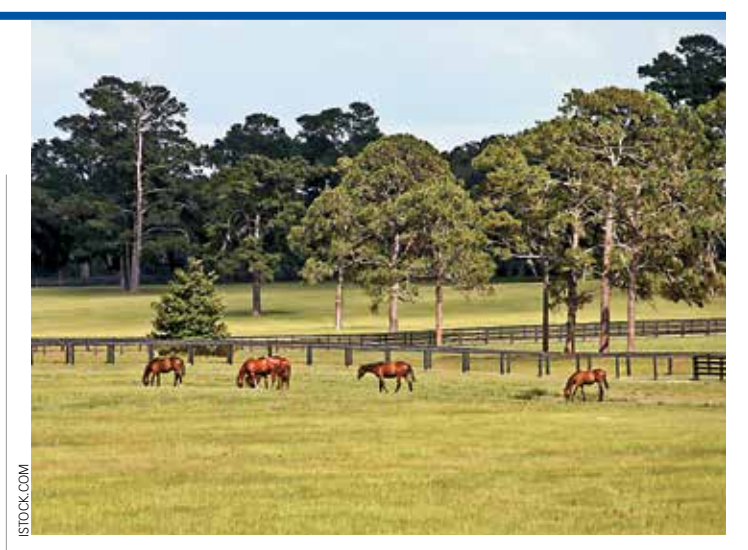
Consider fertilizing cool-season grass pastures in early spring to improve the quality of forage your horses have to graze.

prepare plants for overwintering. Well-fertilized pastures will survive winter better and will green up sooner in the spring.