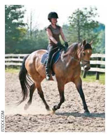
Many female equestrians find that current bras don't offer appropriate support during gaits such as the sitting trot.

L adies, are you still in search of that elusive piece of riding equipment—a bra that actually offers adequate support in the saddle—and suffering painful consequences in the meantime? You're not alone.