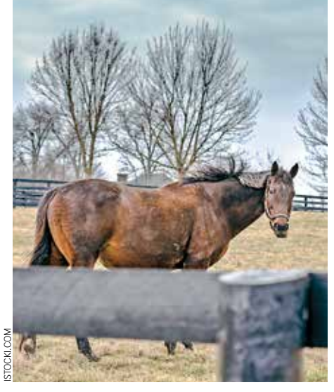
Tall fescue toxicosis can cause prolonged gestation and/or low or no milk production.

Naturally occurring tall fescue is often infected with an endophytic fungus that can produce ergovaline, a known vasoconstrictor that causes blood vessels to narrow. This can cause