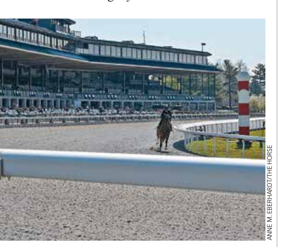
At 2-year-old in training sales buyers can watch horses "breeze," or run a short distance that's timed.

In their study they used data from all 2013 U.S. Thoroughbred 2-year-old in training sales. While many academic studies have focused on price analysis in yearling markets, the 2-year-old market is one that researchers have not yet investigated. This market is different from the more common yearling market for a few reasons. First, the 2-year-old in training auctions occur just a few months prior to a horse's first start on the racetrack. Second, and the focal point of this study, is that before interested buyers bid on the horse, they have the opportunity to watch the horse "breeze," or run a short distance on a racetrack that is timed. Breeze times provide a new type of relevant information to potential buyers prior to the sale, in addition to the horse's action and running style.