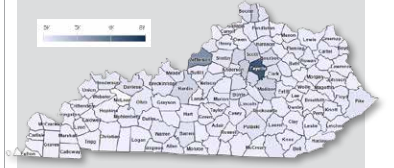
RABIES TESTING TREND CHART