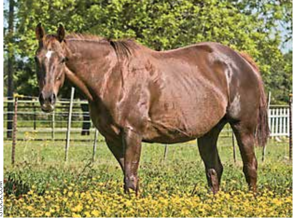
Veterinarians can garner information about reproductive problems in mares via endocrine tests.

Progesterone, one of the most well-studied progestogens, plays a role in maintaining pregnancy. The corpus luteum (CL). the temporary structure that contains an ovarian follicle, secretes progesterone. In the absence of pregnancy, the CL degrades and progesterone concentrations drop. However, if an embryo is present, the CL's lifespan is extended and progesterone concentrations begin to increase immediately after oculation and continue to increase until 60-120 days of gestation. Veterinarians can measure progesterone concentrations to determine if there is enough hormone present to sustain pregnancy. Progestogens also can also be used during late gestations as biomarkers for placentitis, Esteller-Vico said.