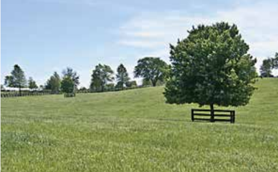
Well-planned pasture re-establishment can produce highquality grazing for years. This pasture was re-established in 2012 and is still highly productive.