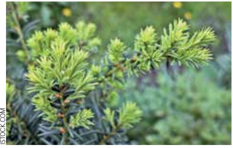
A number of plants—including yew (above), rhododendrons (top right), and white snakeroot (bottom right)—can cause cardiac damage in horses.

White snakeroot is a perennial woodlands plant common throughout