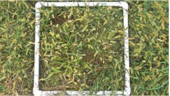
Yellow foxtail, a poor-quality forage, has seedheads that can irritate a horse's mouth. Most horses avoid foxtail if other forage is available.

Pastures in the southern United States dominated by bermudagrass, bahiagrass, crabgrass, and other warmseason grasses are in peak production in the summer. Many of these grasses have high nitrogen requirements, so fertilize them, if needed, using stable nitrogen forms. In these pastures, start planning now for planting winter cover crops, such as annual ryegrass.