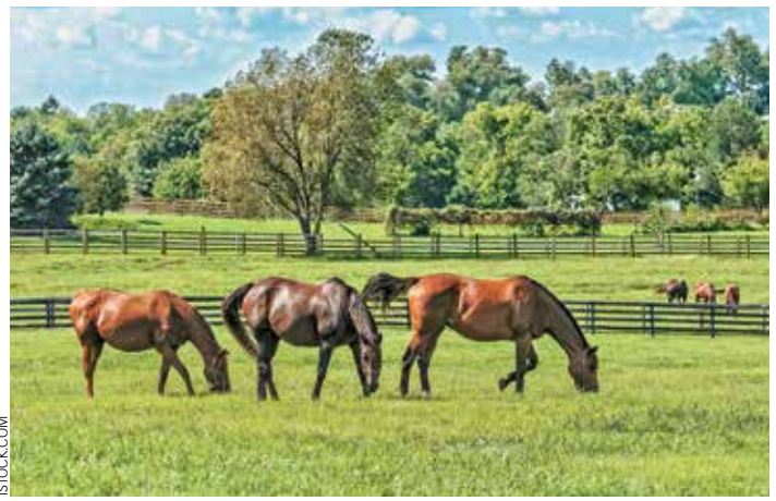
The expo is designed to provide horse farm owners and managers a hands-on event that shows practical solutions for facilities and pasture management.

The UK Ag Equine Programs will host an Equine Farm and Facilities Expo from 3:30 p.m. to 8 p.m. on Thursday, June 8, at New Vocations at Mereworth Farm, 719 Dolan Lane in Lexington. The event is free, and a meal will be provided.