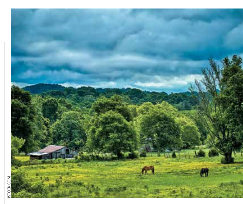
Animals, including horses, are especially vulnerable during natural disasters such as hurricanes, tornadoes, floods, and winter storms.

The exercise is designed to simulate a real-world disaster. Each state will