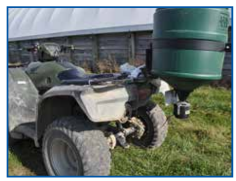
ATV with broadcast spreader

Broadcast spreader These are simple funnel-shaped drums that mount on the back of a tractor or ATV and broadcast seed or fertilizer onto the ground. They are best used to spread granular fertilizers over pastures or seed clovers into a pasture in late winter (known as frost seeding). When seeding cool-season grasses using a broadcast spreader, it is essential to follow with a cultipacker to ensure good soil to seed contact. When using a broadcast spreader for fertilizer applications, be sure to clean the equipment thoroughly and lubricate after each use as many fertilizers will cause corrosion.