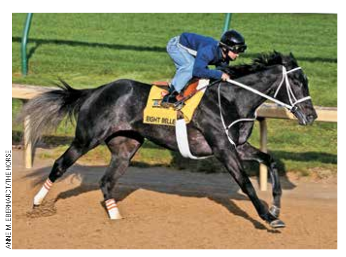
Eight Belles suffered catastrophic compound fractures of both front legs while galloping out after finishing second in the 2008 Kentucky Derby. Her death was one of the catalysts behind the KHRC necropsy program.

Kennedy said control horses—those that die from non-musculoskeletal causes such as colic, laminitis, or illness—are just as important as the horses with catastrophic injuries. Such horses lived and trained in the same general environment, she said, but did not suffer catastrophic injury.