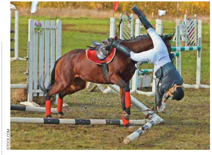
Scientists hope to find more accurate ways to recognize when a concussion has occurred.

As a result of the increasing focus on head and brain injuries, the International Ice Hockey Federation, the International Olympic Committee, Fédération Internationale de Football Association, World Rugby, and the Fédération Equestre Internationale have taken lead roles in organizing the conference into the world's most influential process for policymakers on concussions in sports.