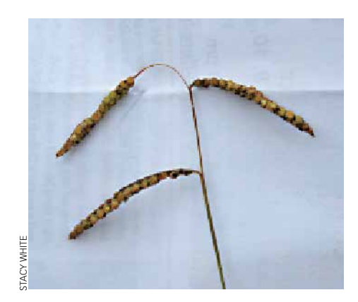
Infected dallisgrass seedheads are often swollen and rusty or black in color.

It has been traditionally found in the southeastern United States, but as climate change has led to increasingly warmer temperatures, its range has expanded to include parts of Kentucky. Currently the USDA plants map shows dallisgrass in at least 22 Kentucky counties.