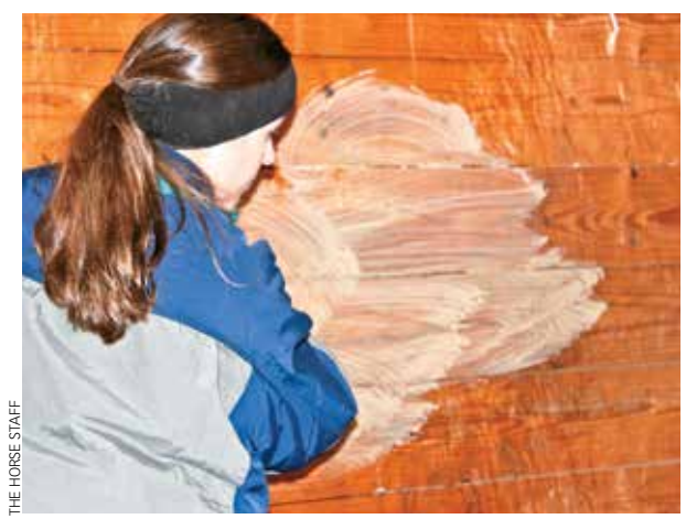
Appropriately cleaning a stall takes manual labor.

Never mix different disinfectants together. For example, bleach combined with ammonia or strong oxides can produce lethal gas and dangerous chemical compounds. Every approved disinfectant in the United States has a safety data sheet (previously known as a material safety data sheet) which is available from the manufacturer and contains valuable information.