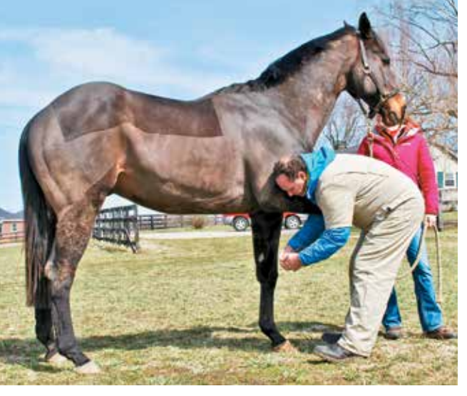
Ask your veterinarian for a list of "call ifs," such as subtle performance or attitude changes, to identify and treat health problems early.

Knows what's normal for the horse chances are, any variation is either normal aging or signs of an agerelated medical problem. Of course, it's essential to know the difference between those, as well, she said. For example, those gray hairs speckled on your horse's face and his slight swayback are probably normal signs of age. The extra-long haircoat that