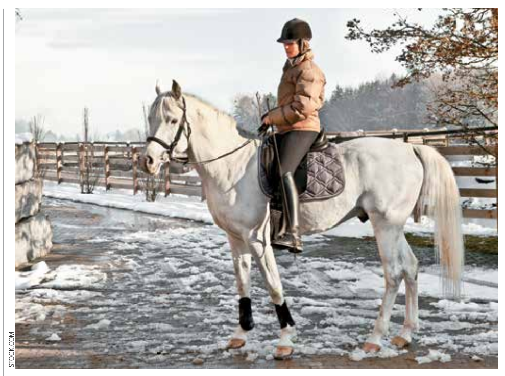
Keeping senior horses in a regular work program can help delay the onset of age-related changes, such as muscle wasting and exercise intolerance.

Little said these goals can be achieved when the horse's care team: