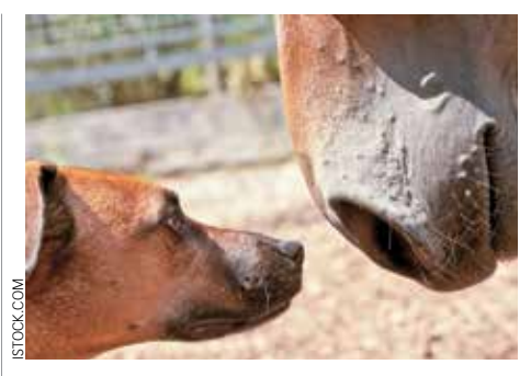
About 15-20 years ago, H3N8 horse flu infected dogs in the United States and has persisted in dogs ever since.

Can bird flu viruses infect horses? The answer is most likely yes. One piece of evidence is that the H3N8 subtype was not always circulating in horses; it first appeared in 1963, and its genetic ancestors seem to have been bird flu viruses. In 1989 in northern China a strain of bird flu was positively confirmed to cause a large-scale disease outbreak in horses. Its subtype was also H3N8. Was that coincidence or is there some unique characteristic of the H3N8 subtype that makes it more apt to