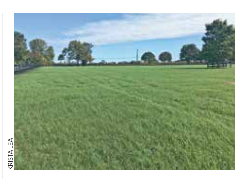
This Central Kentucky pasture was killed in summer 2017 and reseeded with a Kentucky bluegrass/orchardgrass/novel fescue mixture in early September. By October, the pasture was well-established and will provide excellent grazing to horses next spring.

Now is the time to begin considering complete re-establishment and making plans for it during the upcoming summer. The UK Equine Pasture and Forage Working Group has planned the annual Pastures Please!! meeting to cover re-establishment and much more.