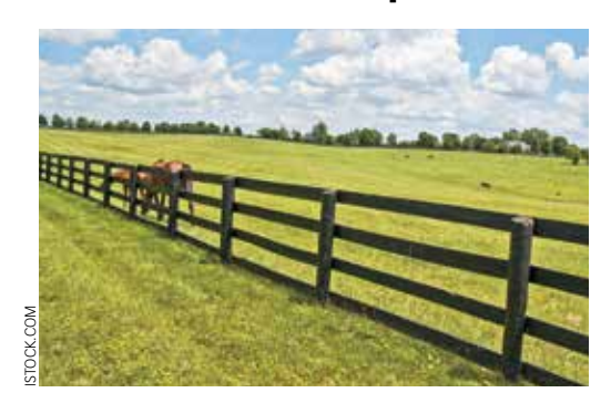
The 2018 program will focus on reestablishing pastures and weed control.

U niversity of Kentucky Ag Equine Programs will host its 11th Pastures Please!! pasture maintenance workshop from 6 to 8 p.m. EST on Monday, Jan. 22, 2018, at the Scott County Extension Office, 1130 Cincinnati Road, in Georgetown.