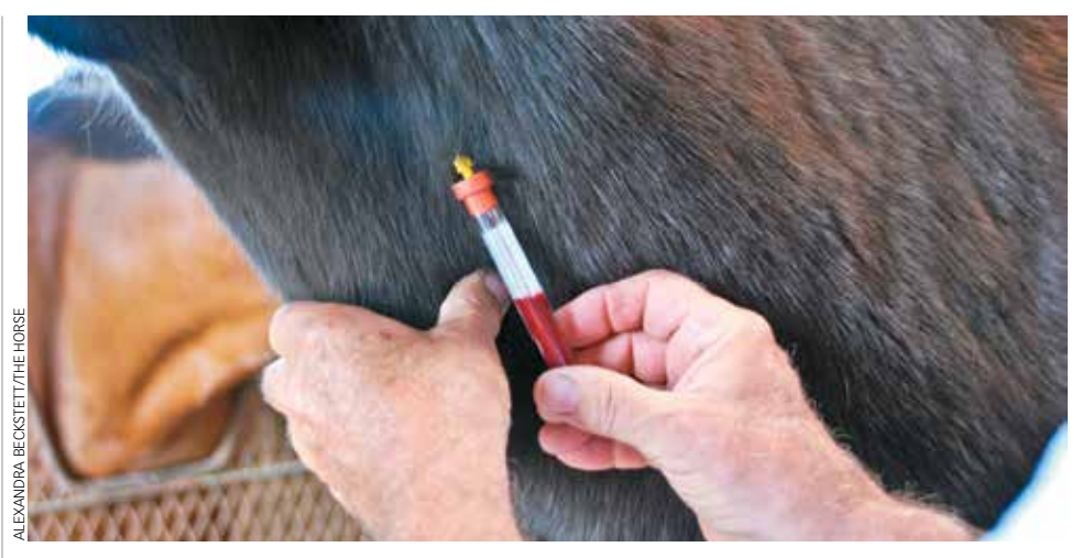
In the study, blood tests revealed that 26 of 59 apparently healthy horses were EIA-positive. However, 18 of the 33 horses that tested negative on blood tests were EIA-positive via molecular testing.

However—and to the researchers' surprise—18 of the 33 remaining, seronegative horses (55%) tested positive in molecular testing (PCR), she added. Over the next two years, the scientists continued to test these seronegative horses regularly. Some seroconverted during this time, but others did not. More in-depth testing confirmed these horses did, in fact, harbor EIAV DNA sequences in their bodies. In other words, they carried the EIA virus without developing the changes in the blood that would create the markers that cause positive blood tests.