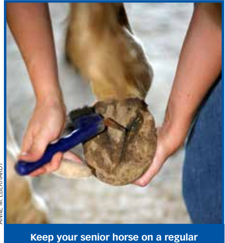
Keep your senior horse on a regular hoof care schedule during winter, and consider pulling his shoes or adding traction devices or snow pads.

Overall, remember that you might need to increase your senior horses' daily feed to meet his body's increased demands during harsh winter weather conditions. It is critical to assess BCS regularly to