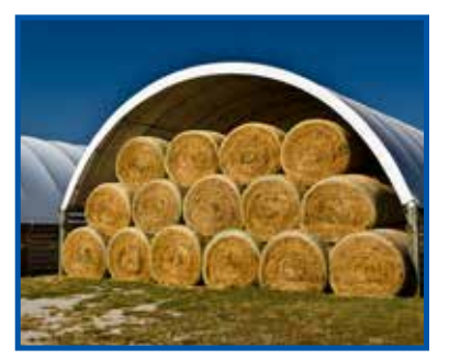
Proper storage and handling of round bales will minimize botulism risks.

Truth: Proper storage, handling, and feeding of round bales and silage will minimize botulism risk. Cover round bales when stored, and feed them using a hay feeder to reduce contamination from trampling and urination. Do not feed round bales that show clear signs of mold to horses. Feeding silage to horses is much more common