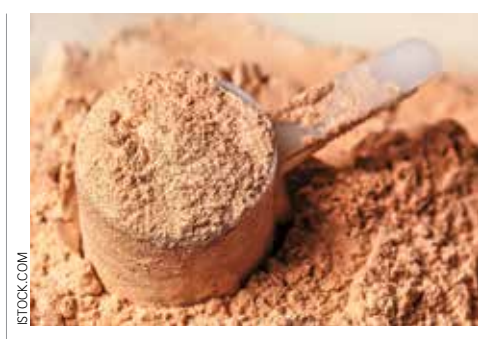
The wide variability among microbe species and horses' microbiomes make pro- and prebiotic research challenging.

Fermentation products —These are also marketed as benefiting digestive health. Fermentation products are byproducts of bacterial growth and not live organisms. Therefore, they aren't technically probiotics.<sup>1</sup> These byproducts might contain LAB-produced enzymes, but there is limited evidence to support any major health benefit from their use.