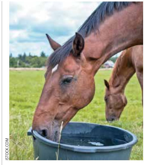
The NRC set the maximum tolerable level for horses at 40 mg F<sup>-</sup> per kg of dietary dry matter (total dietary intake), but noted that level could decrease if horses' drinking water exceeds 3 mg F<sup>-</sup>/L.

Fluorosis (or F<sup>-</sup> toxicity) occurs when an individual consumes excessive amounts of F<sup>-</sup>. Early signs of fluorosis can typically be noted in younger animals' teeth. Signs of more advanced fluorosis can include unthriftiness,