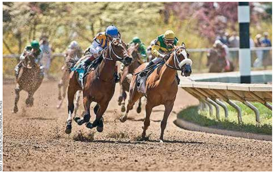
Researchers are examining whether inflammatory and anti-inflammatory markers could serve as early indicators for potential catastrophic injuries in racehorses.

he Kentucky Horse Racing Commission (KHRC) has voted unanimously to fund a project at the University of Kentucky (UK) Maxwell H. Gluck Equine Research Center examining inflammatory and anti-inflammatory markers as early indicators for potential catastrophic injuries in racehorses.