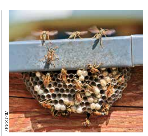
Several kinds of wasps can be problematic for horse owners because nooks and crannies around barns and sheds provide good nesting sites.

A Several kinds of wasps can be problematic because nooks and crannies around barns and sheds provide good nesting sites. Paper wasps and mud daubers commonly build their nests under eaves and overhangs. Generally, these insects are not aggressive until late summer. Colonies are at