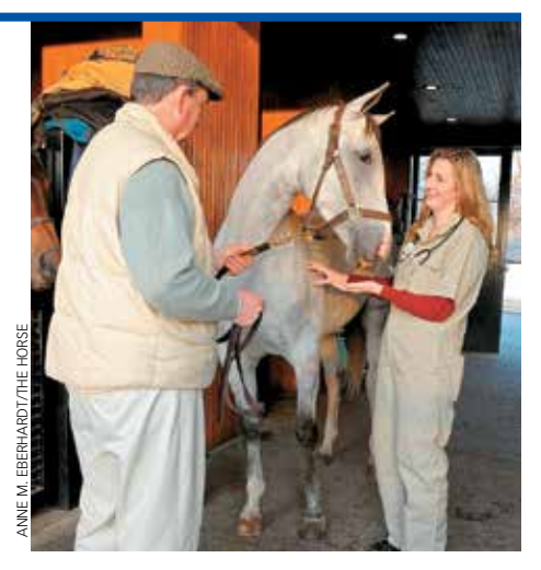
Nearly twice as many respondents are now talking to their veterinarians about the American Association of Equine Practitioners' vaccination recommendations and requesting specific vaccine brands compared to previous surveys.