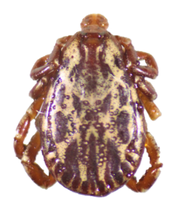
MALE AMERICAN DOG TICK, PHOTO COURTESY ANNA PASTERNAK.