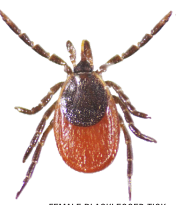
FEMALE BLACKLEGGED TICK, PHOTO COURTESY ANNA PASTERNAK.