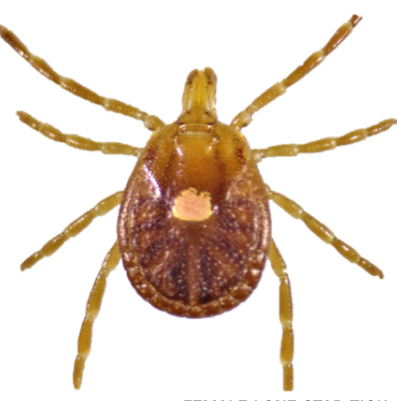
FEMALE LONE STAR TICK, PHOTO COURTESY ANNA PASTERNAK.